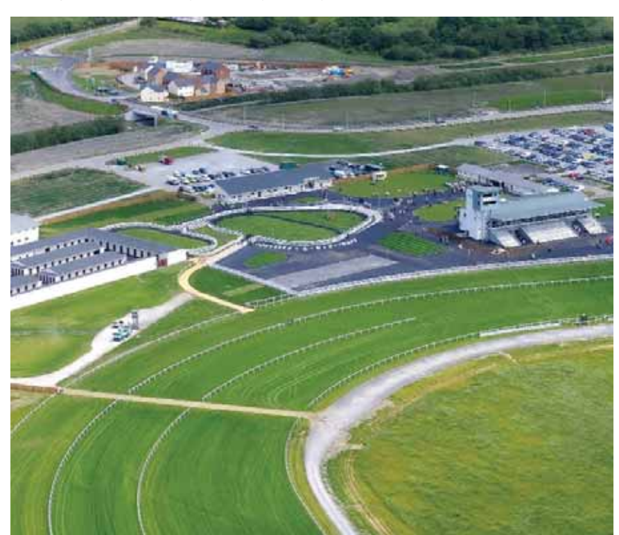
FFOS LAS The new stand, stabling, parade ring and car parks at Ffos Las, the first dual Flat and Jump racecourse to be built in the UK for many years, converted from an open-cast mine in Wales. Partly-funded by the Levy Board with an interest-free loan of £4m.