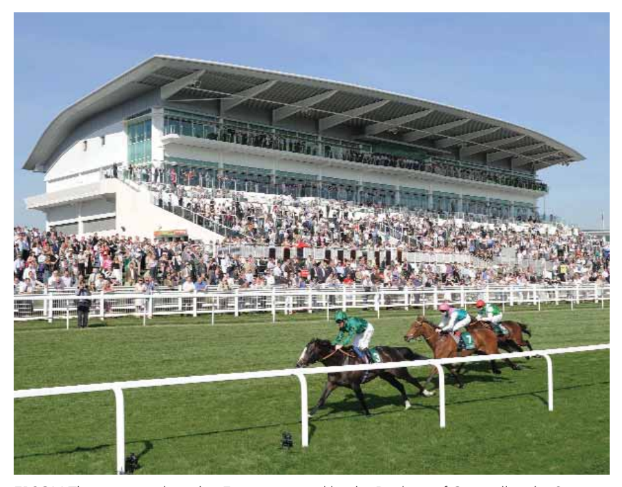
EPSOM The new grandstand at Epsom, opened by the Duchess of Cornwall at the Spring Meeting in April 2009. Partly-funded by the Levy Board with an interest free loan of £6m.